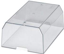
Cover, for the contact- and dust-protected encapsulation of the components

Please be informed that the data shown in this PDF Document is generated from our Online Catalog. Please find the complete data in the user's documentation. Our General Terms of Use for Downloads are valid ( http://phoenixcontact.com/download )